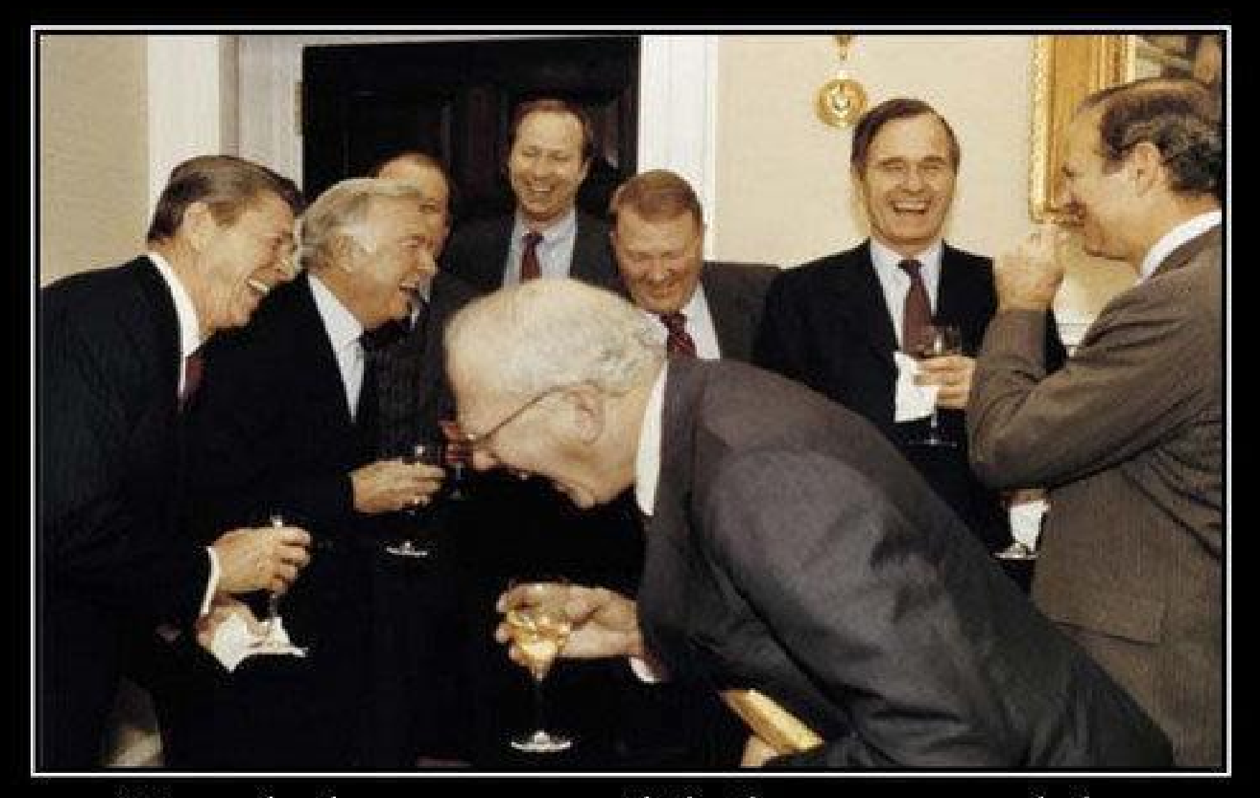
"And then we told them wealth would 'trickle down."